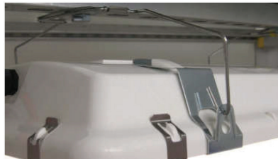
F - Flexible Ceiling Mount 316 Stainless Steel Ceiling Mount attached directly to the ceiling