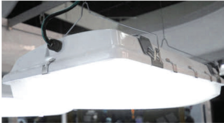
V - V-Hook 316 Stainless Steel V-Hook UL rated for 4X fixture weight