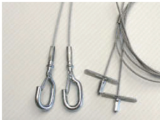
Cable Mount Supplied by others