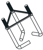
Anchor Bolt Assembly (included)