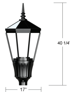
Shown with: UV - Utility Version BK - Black Gloss Finish NL - No Lens