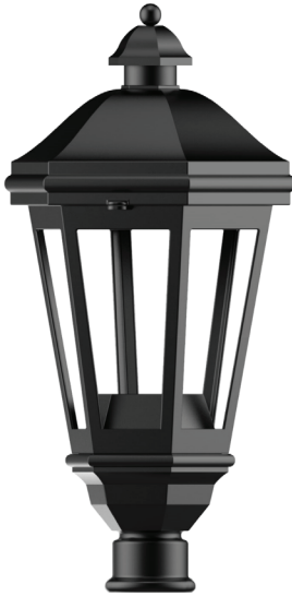
Shown with: BK - Black Gloss Finish NL - No Lens

Requires nominal 3" diameter x 2 7/8" tall tenon