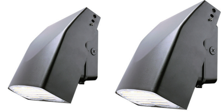
Small Size: 40W

The modern style BLS-WP Wall Pack is available in two watts for a variety of applications including building perimeter, entrances, stairways and security lighting. The Slim wall pack provides a low-profile architectural style with the power of bright, energy efficient LEDs. It has a rugged aluminum construction with multi-mount capabilities. 0° to 90° tilt adjustments.