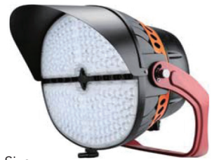
Large Size: 850W