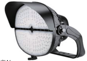
Small Size: 505W & 600W

The BLS-SLR is a powerful stadium light designed with precision engineered optics provide excellent high output and high efficiency, making them ideal solutions for municipal, school and semi-professional outdoor sports lighting. Dynamic thermal management design maximizes heat dissipation and significantly improves the life of luminaires. Built-in surge suppression adds and extra layer of protection to the driver. Versatile mounting bracket for hassle-free installation.