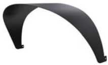
Black Top Visor (default)