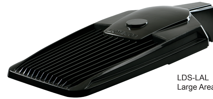
LDS-LAL Large Area Light