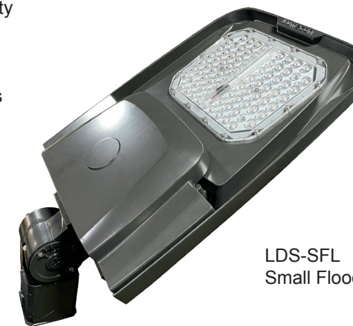
LDS-SFL Small Flood Light