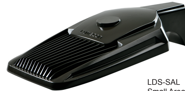
LDS-SAL Small Area Light