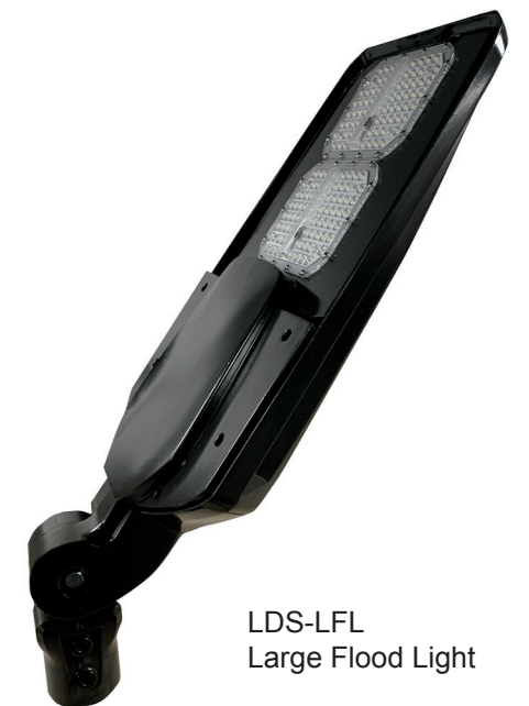
LDS-LFL Large Flood Light