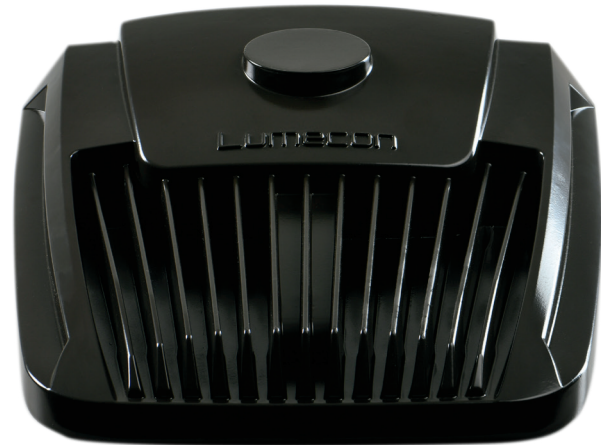
LDS-FC Full Cutoff

Standard options include all typical IES light distribution patterns, mounting configurations, a wide range of wattages with dimming drivers, compatible photocell sockets, energy-efficient controls and custom colors. Every product meets DLC standards and feature precision best-in-class optics and a high efficiency internal heat sink housing.