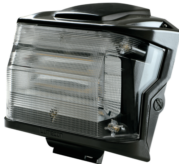
LDS-FT Forward Throw