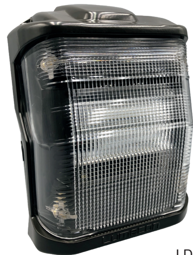
LDS-FTM Mini Wall Pack